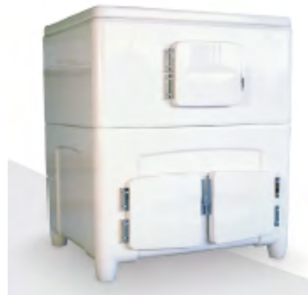
MANUAL ICE STORAGE: ICE BIN

Geneglace offers orbital silos to store flake-ice in ideal hygienic condition for easy and automatic discharge on demand. The first-in-first-out principle ensures fresh ice across the entire consumption period.