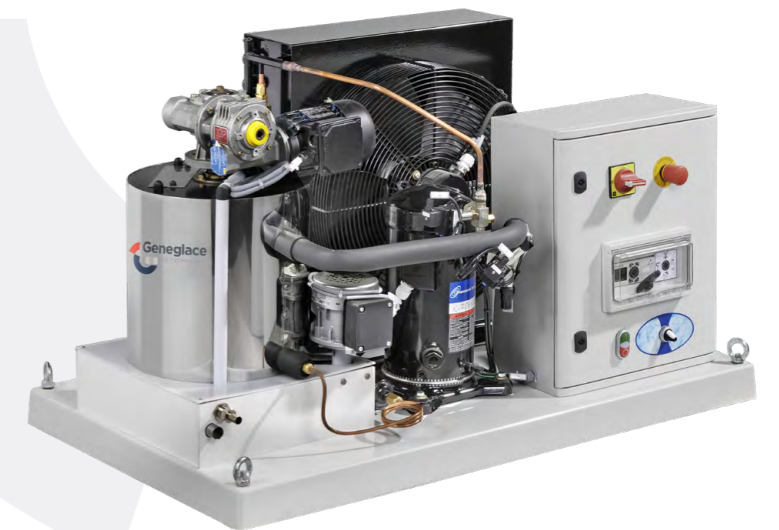
ICE PACK: GENEGLACE PACK 23

Designed with a stainless steel cylinder and stainless steel water path, these machine types are specially designed for food processing with high hygienic standards.