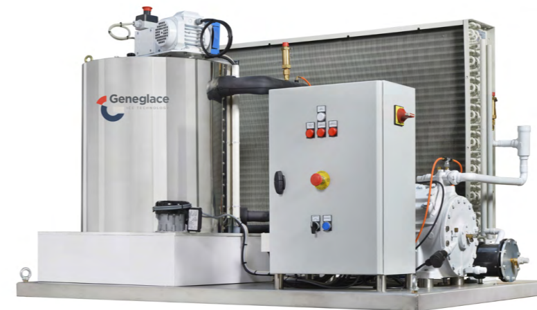
STAINLESS STEEL PACK 6100