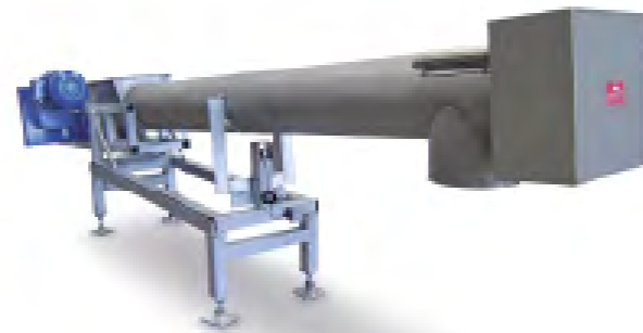
ICE DELIVERY AND WEIGHING SYSTEM: SCREW CONVEYOR

Weighing components are included in our product portfolio to complete our delivery systems.