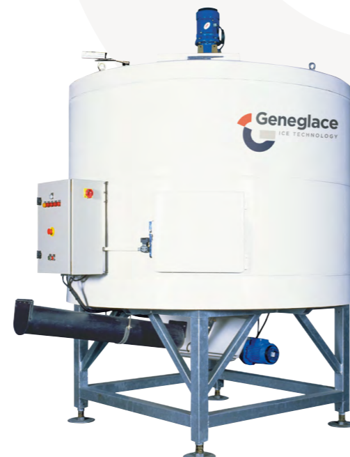
FULLY-AUTOMATED ICE STORAGE: ORBITAL SILO