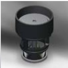
Function module with cone-shaped V-ports for optimum pressure control