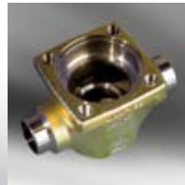
One house for all functions