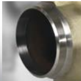
Direct welding connection